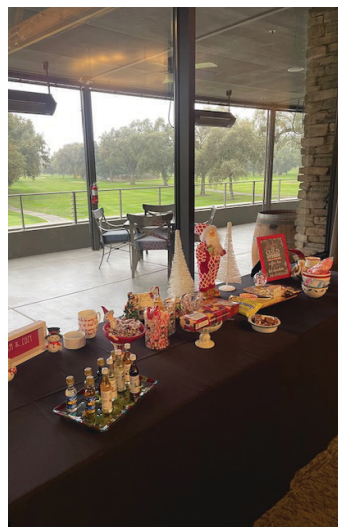
The special Hot Cocoa bar was amazing!